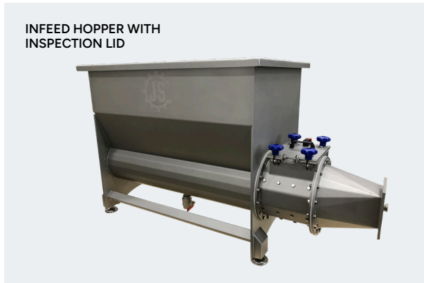
INFEED HOPPER WITH INSPECTION LID

The JS Standard infeed hopper which holds a volume of 600 L consists of a metal container designed to give the product optimal access to the screw.